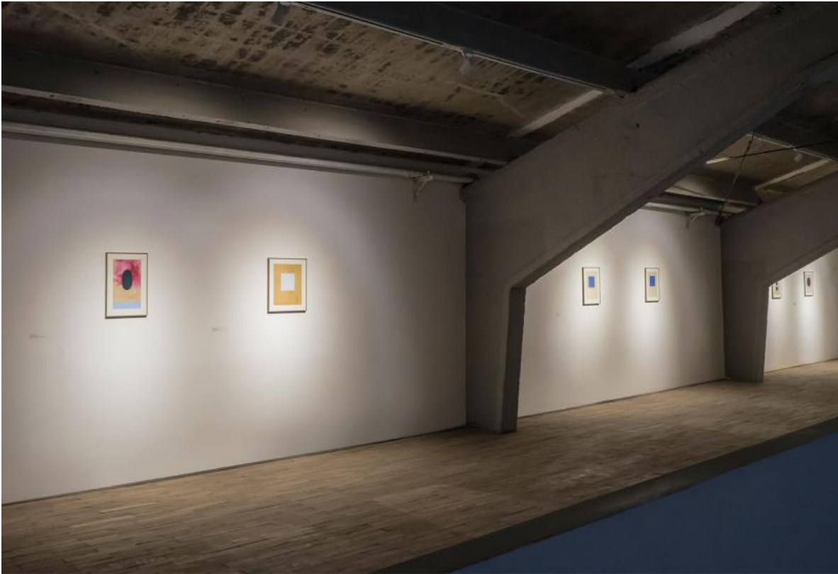
Title : All Means are Sacred, Installation View Date(s) : 27 March - 24 July 2016 Website : http://www.mwoods.org/ ( http://www.mwoods.org/ )

TWITTER (HTTP://TWITTER.COM/HOME? STATUS=CHECK%20OUT%20THIS%20ARTICLE%20ON%20THISISTOMORROW.INFO/ARTICLES/ALL-MEANS-ARE-SACRED) FACEBOOK (HTTPS://WWW.FACEBOOK.COM/SHARE?SUBJECTS=CHECK%20OUT%20THIS%20ARTICLE%20ON%20THISISTOMORROW.INFO/ARTICLES/ALL-MEANS-ARE-SACRED) EMAIL (MAILTO:?) SUBJECTS=CHECK%20OUT%20THIS%20ARTICLE%20ON%20THISISTOMORROW.INFO/ARTICLES/ALL-MEANS-ARE-SACRED&BODY=HTTP://THISISTOMORROW.INFO/ARTICLES/ALL-MEANS-ARE-SACRED) PINTEREST URL=HTTP://THISISTOMORROW.INFO/ARTICLES/ALL-MEANS-ARE-SACRED&MEDIA=HTTPS://TIMASSETS.S3.AMAZONAWS.COM/ARTICLES/2016/04/16/THISISTOMORROW.INFO/2_MEDIUM.JPG&DESCRIPTION=MMEANS-ARE-SACRED) GOOGLE+ (HTTPS://WWW.GOOGLE.COM/SHARE?url=HTTP://THISISTOMORROW.INFO/ARTICLES/ALL-MEANS-ARE-SACRED&title=All%20Means%20Are%20Sacred)