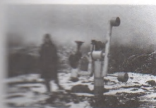
Michael Snow La Région Centrale , 1977, production study